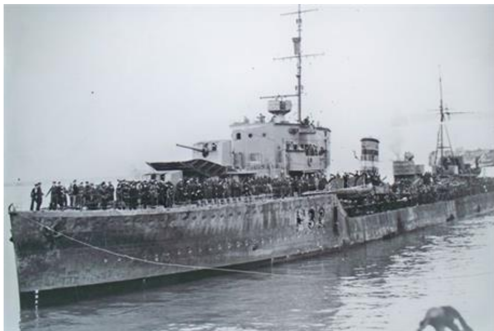
HMS Havant entering Dover with troops from Dunkirk, 31 May 1940.