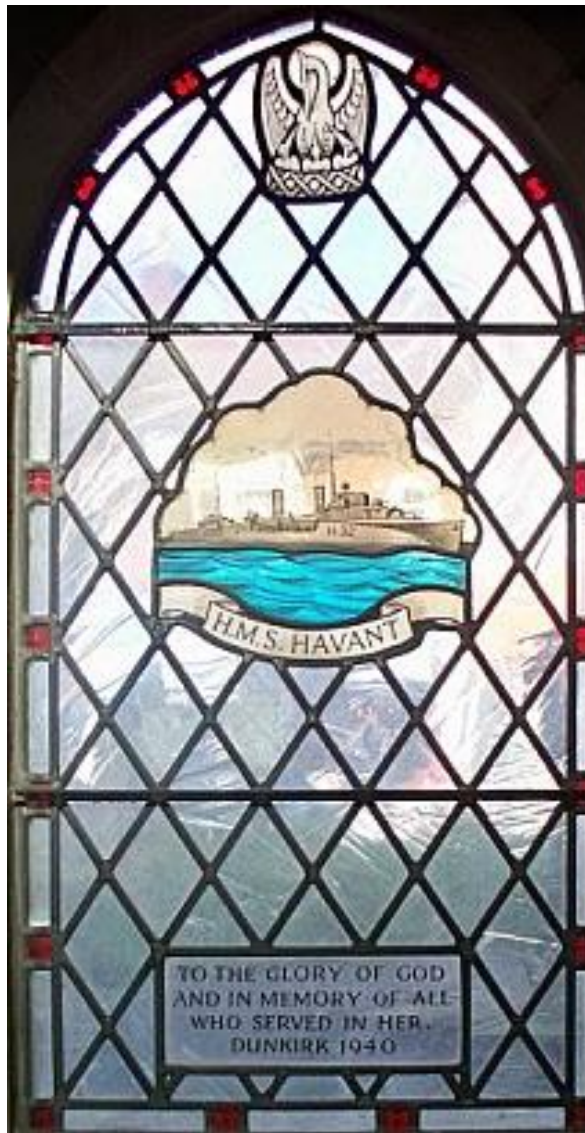
Memorial window in St Faith's Church, Havant

TO THE GLORY OF GOD AND IN MEMORY OF ALL WHO SERVED IN HER, DUNKIRK 1940.