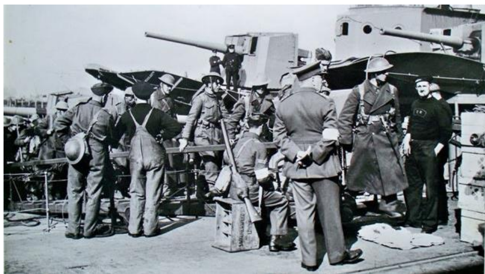
For nine days, between 26 May and 4 June 1940, nearly 340,000 British and French troops were evacuated from Dunkirk.