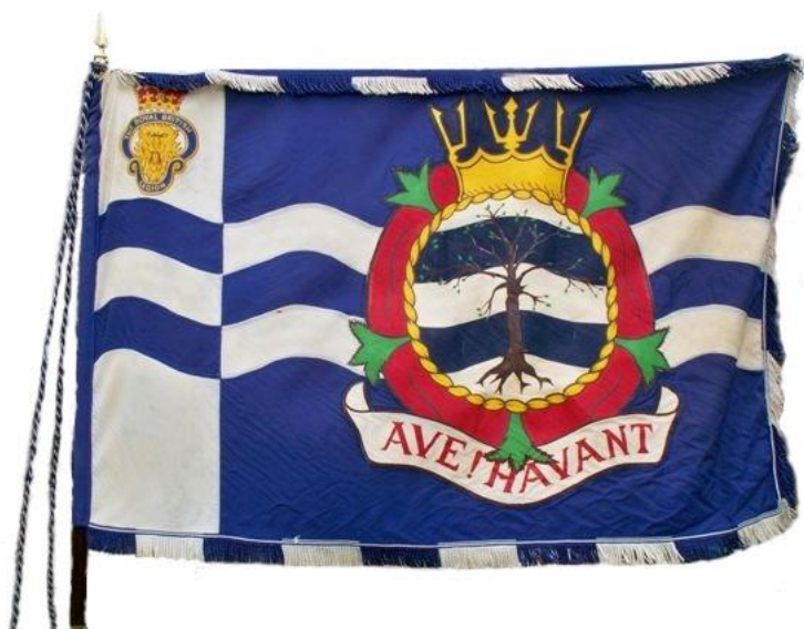
The Royal British Legion banner for HMS Havant . AVE! HAVANT – GOOD WISHES! HAVANT